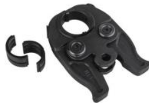
Universal Jaw with interchangeable die fit for PEX pipe, Economic design for any needs.