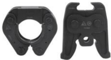
Adaptor/Pressing Rings for copper & stainless pipe from 42-54mm

The Standard Series Pressing Jaws Were Designed In Conjunction With The Fitting Manufacturer, Ensuring Compatibility.