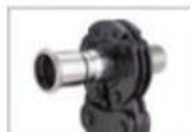
Thin-wall stainless steel pipe, Copper pipe.