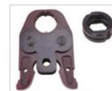
Universal Jaw Interchangeable die