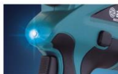
LED light for dark place.