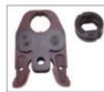
Universal Jaw Interchangeable die